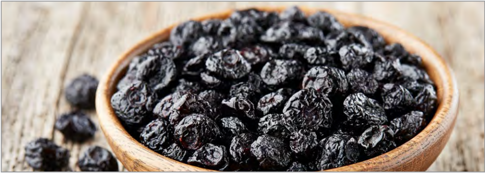
JUICE SWEETENED BLUEBERRIES In Bulk.