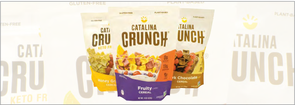
CATALINA CRUNCH KETO FRIENDLY CEREAL 8 to 9 oz.