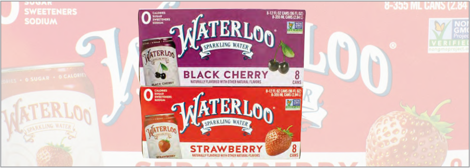
WATERLOO FLAVORED SPARKLING WATER Selected varieties. 8 pk.