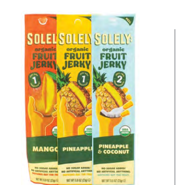
$1.19 SOLELY Fruit Jerky 0.8 oz.