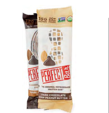
$1.99 PERFECT SNACKS Nut Butter Bar Selected varieties. 1.94 to 2.5 oz.