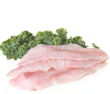
$3.00 off/lb. PRODUCT OF USA & CANADA Northeast Pacific Petracle Sole Fillets At the seafood counter.