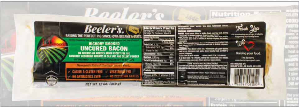
BEELER'S BACON 12 oz.