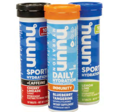
$4.99 NUUN Electrolyte and Immune Tablets 10 count.