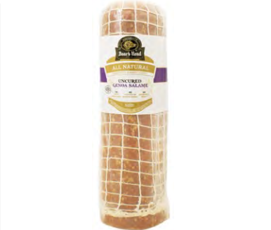
$2.00 off/lb. BOAR'S HEAD All Natural Genoa Salami At the Deli counter.