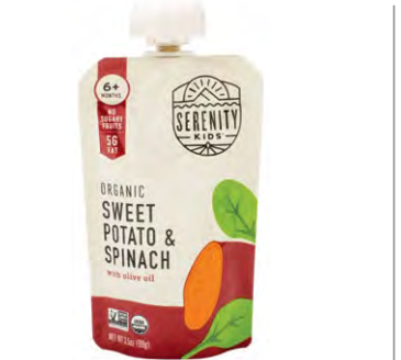
$1.89 SERENITY KIDS Organic Baby Food Selected varieties. 3.5 oz.