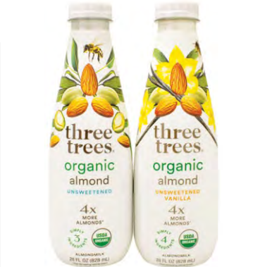
$4.99 THREE TREES Unsweetened Almondmilk 28 oz.