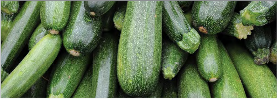
CERTIFIED ORGANIC ZUCCHINI