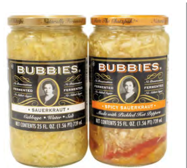
$6.49 BUBBIES Sauerkraut 25 oz.