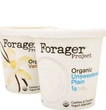
$4.39 FORAGER PROJECT Dairy-Free Cashewgurt 24 oz.