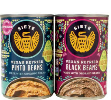
$1.89 SIETE Vegan Refried Beans 16 oz.