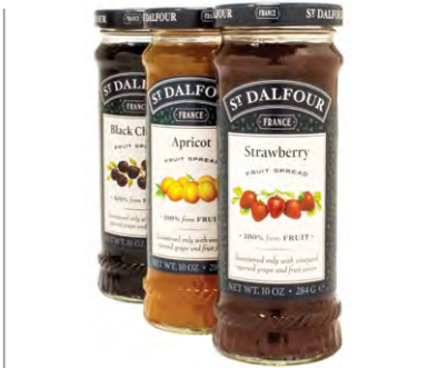
$2.89 ST. DALFOUR Fruit Spread 10 oz.