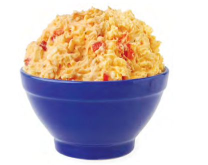
$2.00 off GOOD FOOD STORE DELI Pimento Cheese Spread In the deli grab & go cooler.