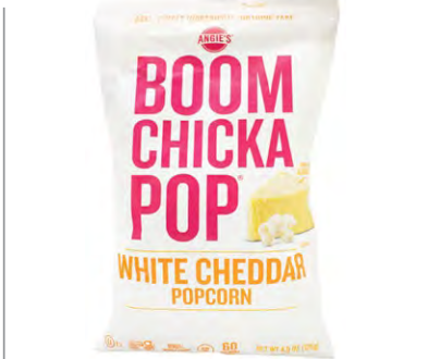
$2.59 ANGIE'S BOOMCHICKAPOP Popcorn 4.5 to 7 oz.