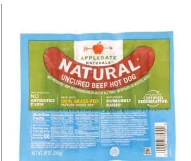
$1.00 off APPLEGATE Beef Hot Dogs 10 oz.