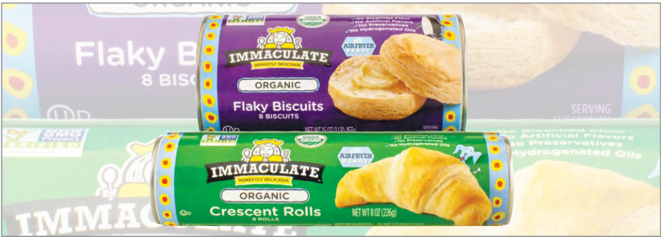
IMMACULATE BAKING BISCUITS AND CRESCENT ROLLS 8 to 16 oz.