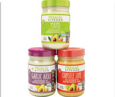
$6.99 PRIMAL KITCHEN Mayo Made with Avocado Oil 12 oz.