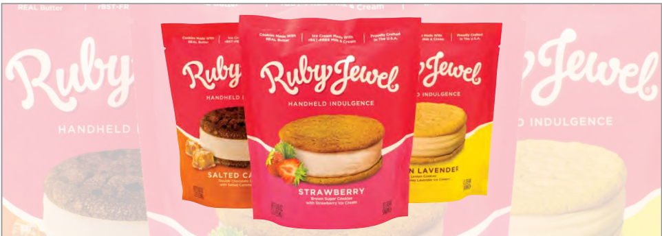
RUBY JEWEL ICE CREAM SANDWICHES 5 to 5.25 oz.