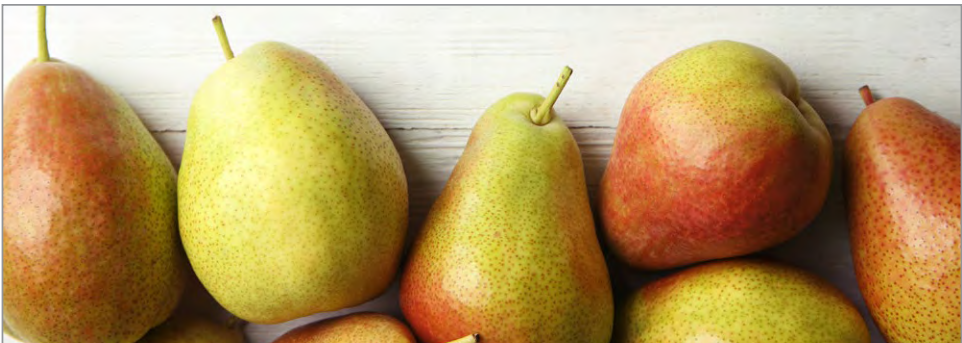
CERTIFIED ORGANIC BARTLETT PEARS