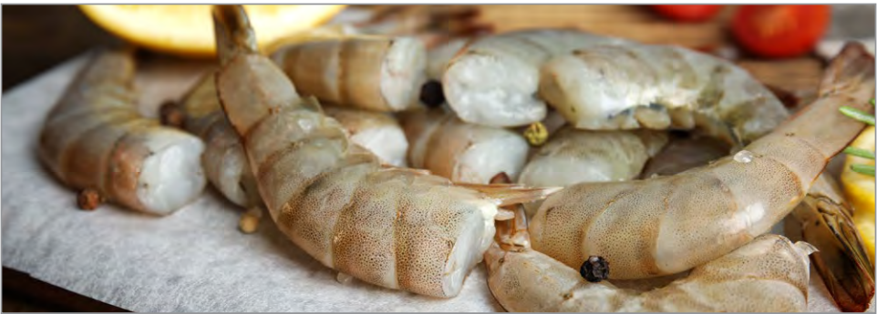
PRODUCT OF TEXAS 16/20 SHELL ON SHRIMP At the seafood counter. 2 lb. bags available in the freezer aisle.