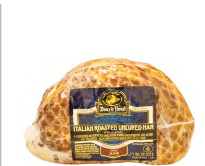
$2.00 off/lb. BOAR'S HEAD Italian Roasted Ham At the deli counter.