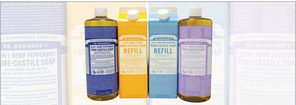
DR. BRONNER'S CASTILE LIQUID SOAP 32 oz.