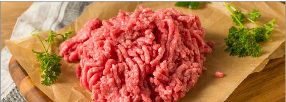
TROYER FAMILY FARM GROUND LAMB Raised in Grangeville, ID. In the freezer aisle.