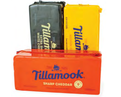
$1.00 off TILLAMOOK Cheddar Cheese 2 lbs.