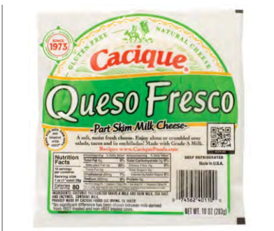
$1.00 off CACIQUE Queso Fresco 10 oz.