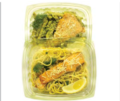
$2.00 off GOOD FOOD STORE DELI Roasted Steelhead Meals With lemon pasta or pesto pasta. In the deli grab & go cooler.