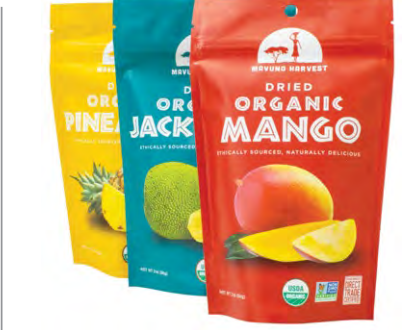
$2.49 MAVUNO HARVEST Dried Organic Fruit 2 oz.