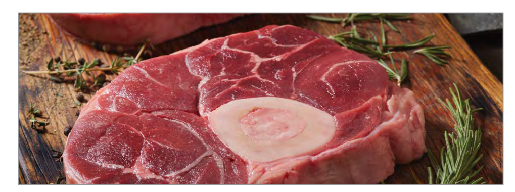
MONTANA RAISED BEEF SHANKS At the Meat & Seafood counter and in the freezer aisle.