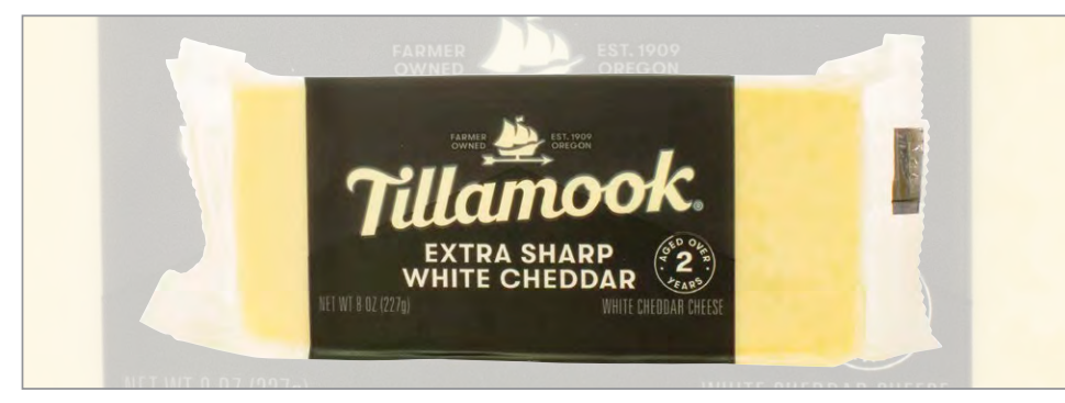
TILLAMOOK EXTRA SHARP WHITE CHEDDAR