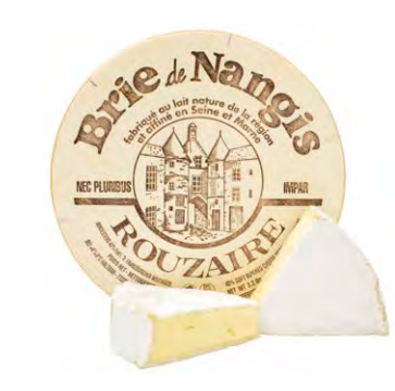
$2.00 off/lb. ROUZAIRE Brie de Nangis Cow's milk cheese from France.