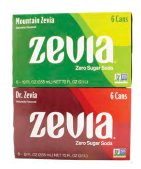
Zero Calorie Soda Selected varieties. 6 pk.