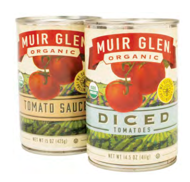
$1.29 MUIR GLEN Organic Canned Tomatoes Selected varieties. 14.5 to 15 oz.