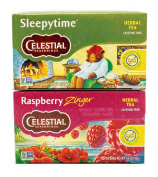
$2.49 CELESTIAL SEASONINGS Herbal Tea Selected varieties. 20 tea bags.