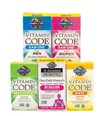
30% off GARDEN OF LIFE Dr. Formulated and Vitamin Code Vitamins and Supplements Selected varieties.