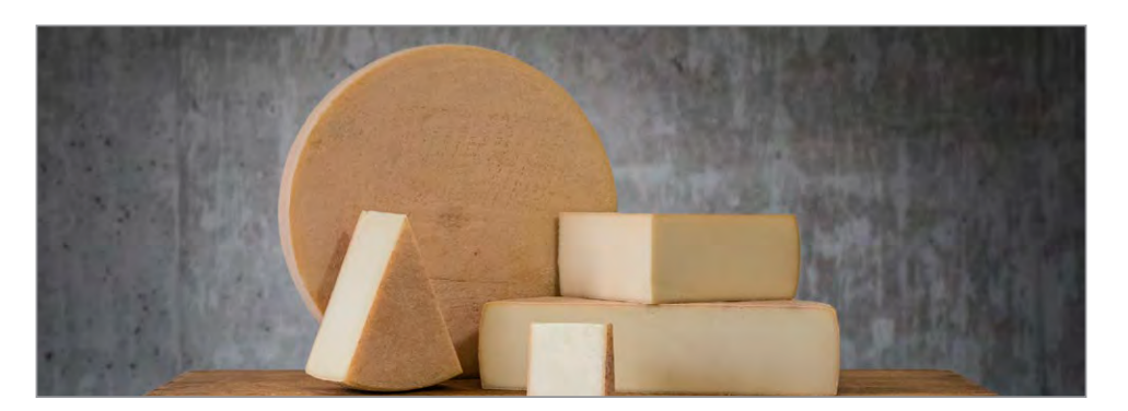
JASPER HILL FARM WHITNEY Cow's milk cheese from Vermont.