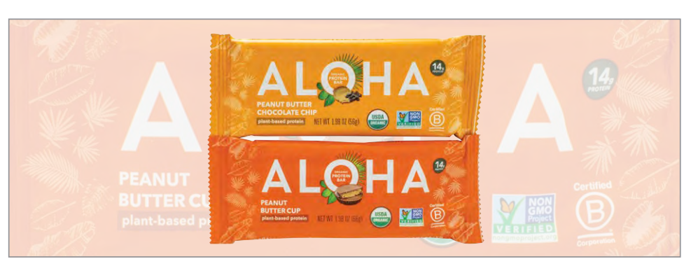
ALOHA PROTEIN BARS 1.9 to 1.98 oz.