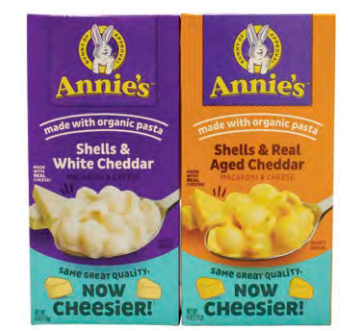
99¢ ANNIE'S HOMEGROWN Macaroni & Cheese Selected varieties. 5.25 to 6 oz.