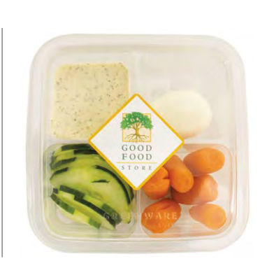
$1.00 off GOOD FOOD STORE DELI 4-Squares In the Grab & Go cooler.