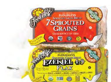
$4.59 FOOD FOR LIFE Sprouted Whole Grain Bread Selected varieties. 24 oz.