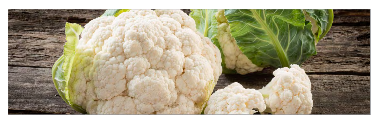
CERTIFIED ORGANIC CAULIFLOWER