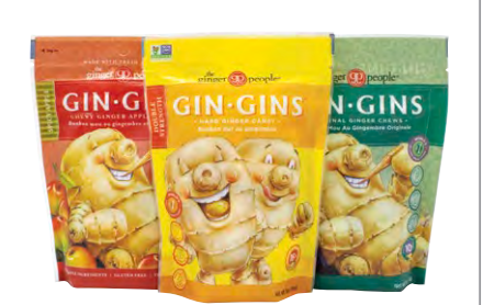
$2.19 THE GINGER PEOPLE Ginger Chews & Ginger Candy Selected varieties. 3 oz.