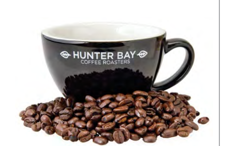
20% off HUNTER BAY Organic Whole Bean Coffee In Bulk.