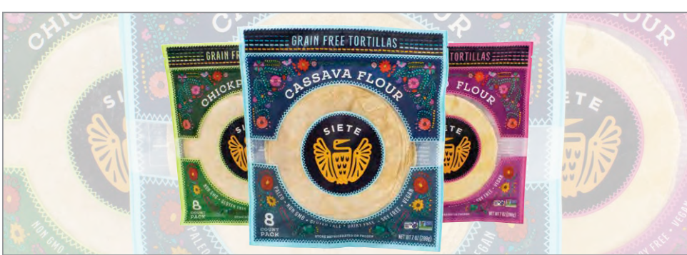
GRAIN-FREE TORTILLAS 7 oz.