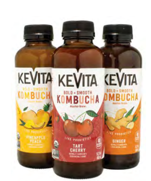
$2.49 Master Brew Kombucha 15.2 oz.