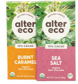
$3.19 ALTER ECO Chocolate 2.65 to 2.96 oz.