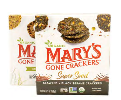
$3.19 MARY'S GONE CRACKERS Gluten Free Crackers 5.5 to 6.5 oz.