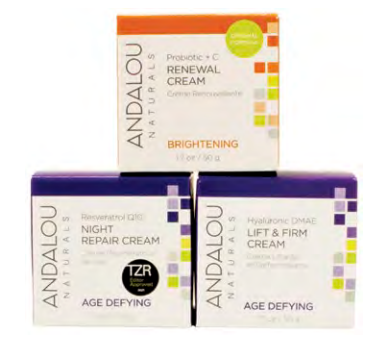
ANDALOU NATURALS Facial Care Selected varieties. 1.1 to 1.7 oz.