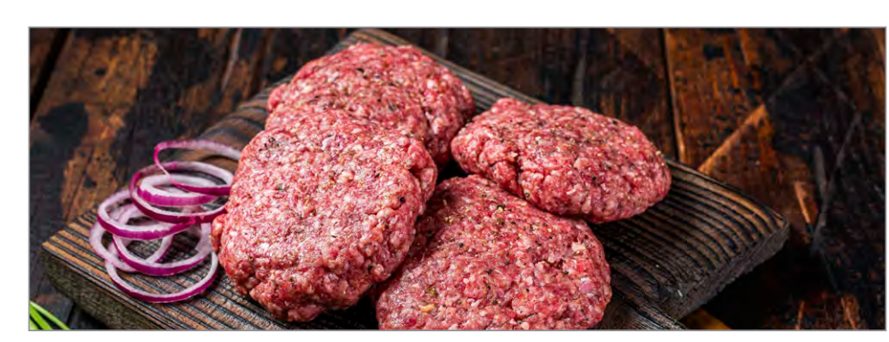
GOOD FOOD STORE SEASONED BEEF BRISKET BURGER At the Meat & Seafood counter. 2-pack in the freezer aisle.