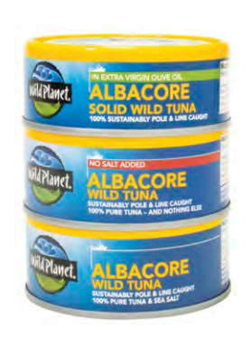
$3.29 WILD PLANET Wild Albacore Tuna 5 oz.