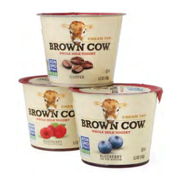
89¢ BROWN COW Cream Top Yogurt 5.3 oz.