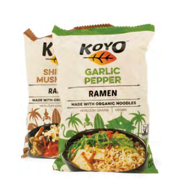
99 ¢ ROYO Ramen 2 to 2.1 oz.