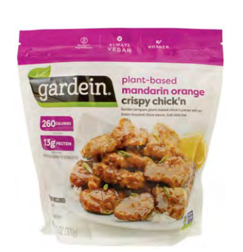
$3.49 Meat Alternatives Selected varieties. 8 to 13.7 oz.