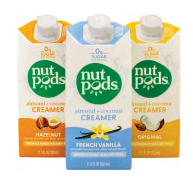
NUTPODS Almond Coconut Creamer 11.2 oz.