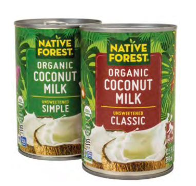
$2.19 NATIVE FOREST Organic Coconut Milk Selected varieties. 13.5 oz.