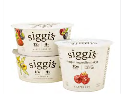
$1.19 Icelandic Style Skyr Selected varieties. 4 to 5.3 oz.