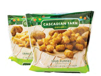
$3.19 CASCADIAN FARM Organic Hash Browns, Spud Puppies and Fries 16 oz.