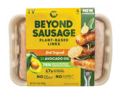
$5.69 BEYOND MEAT Vegan Sausage Selected varieties. 14 oz.