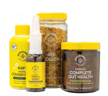
30% off BEEKEEPER'S NATURALS Immune Support Selected varieties.