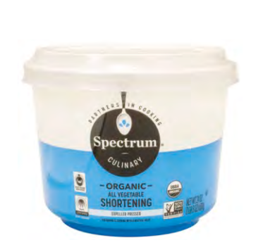
$7.59 SPECTRUM NATURALS Organic All Vegetable Shortening 24 oz.