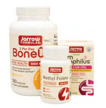
30% off JARROW FORMULAS Energy, Immune and Bone Health Support Selected varieties.