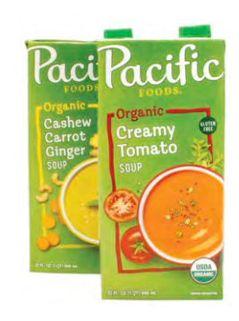
PACIFIC FOODS Organic Soup 32 oz.