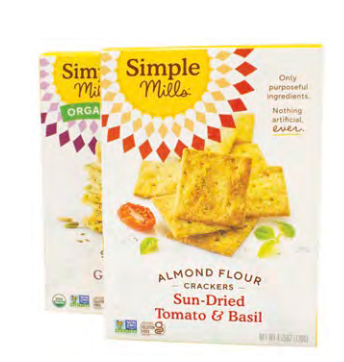
$3.29 SIMPLE MILLS Almond Flour Crackers 4 to 4.25 oz.