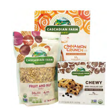
$2.99 CASCADIAN FARM Organic Cereal, Granola and Granola Bars Selected varieties. 6.2 to 13.5 oz.