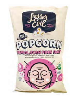
$2.69 LESSER EVIL Organic Popcorn 4.6 oz.