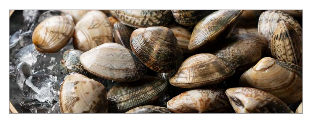
PENN COVE MANILA CLAMS At the Meat & Seafood counter.